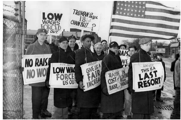
After World War II, members of the Steelworkers in 1946 sought wage gains, to make up for wage freeze during war.

"Unions have been important to my family and my community because . . ."